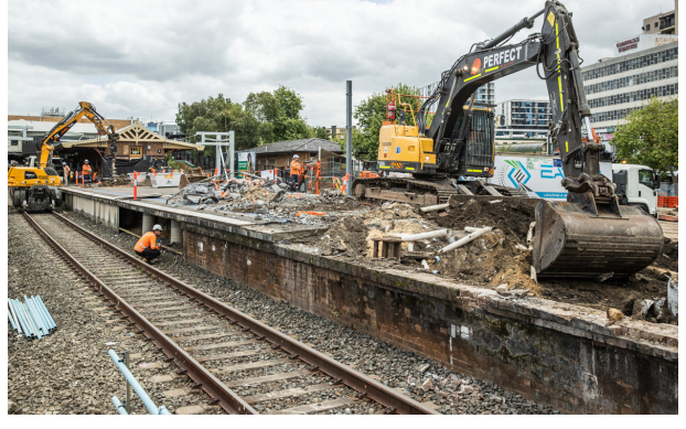
At Bankstown we are creating a new central plaza between the Metro and Sydney Trains stations