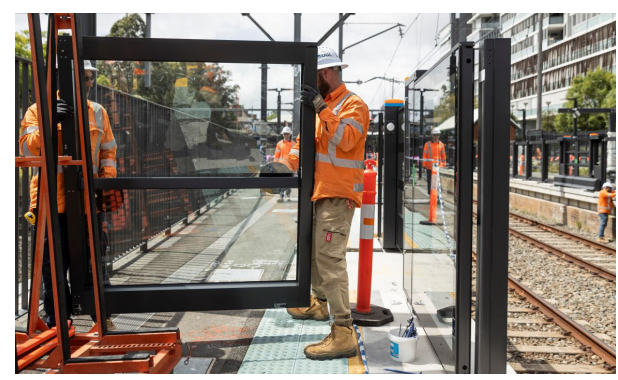
New platform screen doors a key feature of Sydney Metro station